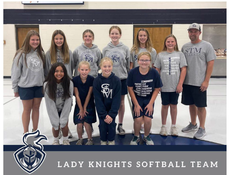
Lady Knights Softball-These ladies fought hard this season! We are so proud of their determination, growth and accomplishments.