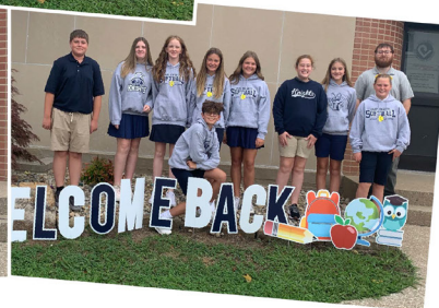
Middle School 1st day of School! They are ready for the year!