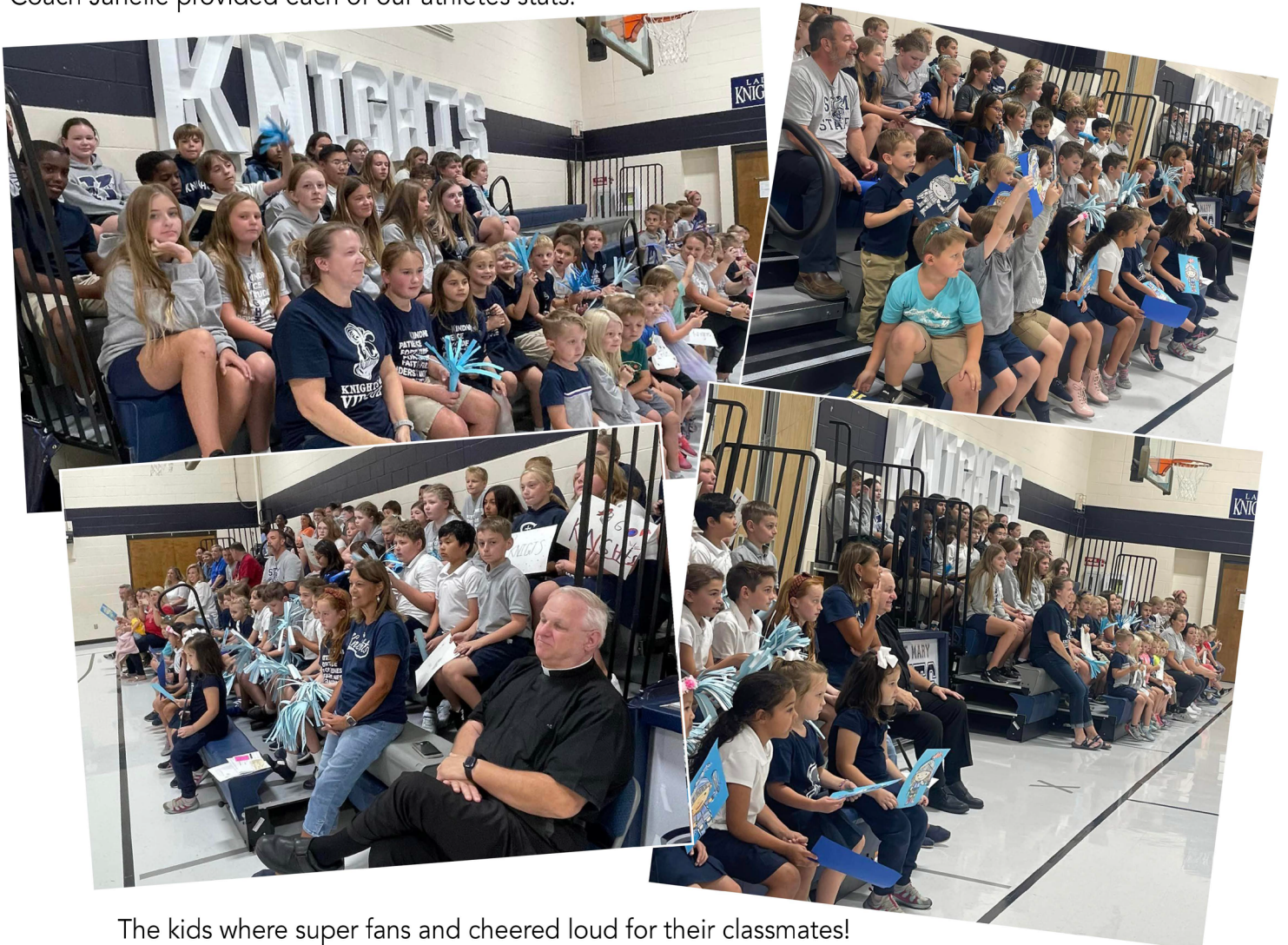
The kids where super fans and cheered loud for their classmates!