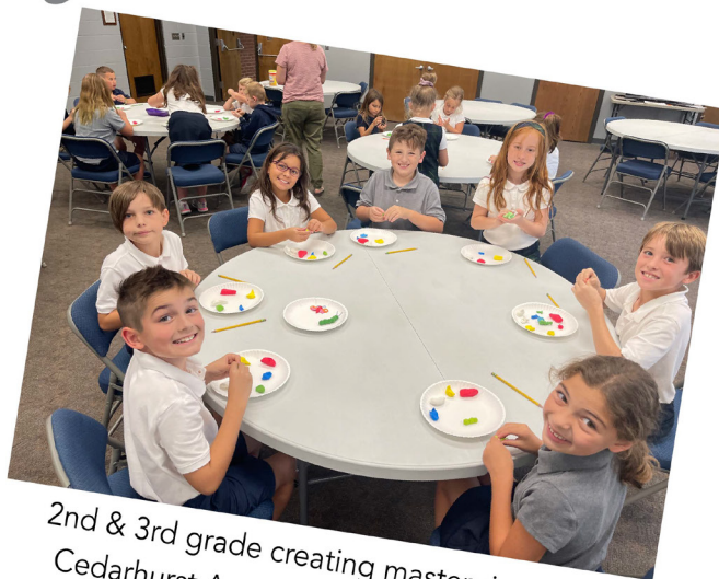
2nd & 3rd grade creating masterpieces with Cedarhurst Art in the Classroom Program!