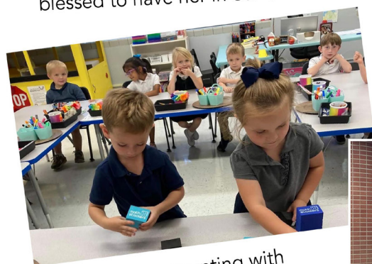
Kindergarten counting with Math Stackers!