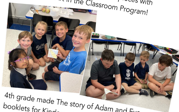
4th grade made The story of Adam and Eve booklets for Kindergarten! They spent time reading them together!